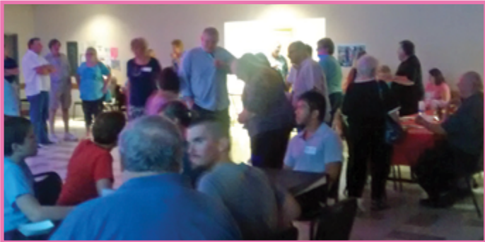
Old friendships at Linwood rekindle.