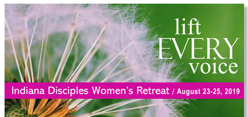
ABE MARTIN LODGE at BROWN COUNTY STATE PARK

Saturday evening, women will celebrate the 145th birthday of the work of women in the Christian Church (Disciples of Christ). The celebration will be preceded by a dinner honoring the work of women's shelters across Indiana but specifically the work of Turning Point in nearby Columbus, Indiana. Women will be asked to bring items to assist this shelter and those gifts will be received and dedicated at dinner. Lists of items needed will be sent out with confirmation letters to retreat participants. It is hoped that upon returning home, each group will find ways to provide similar kinds of assistance to their local women's shelters.